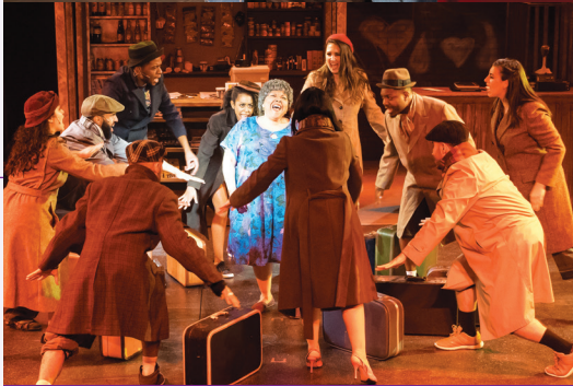
Images (top to bottom): Intimate Apparel , The Diary of Anne Frank , stop/time Dance Theater Celebrates 15 Years , Polkadots: The Cool Kids Musical , In The Heights .